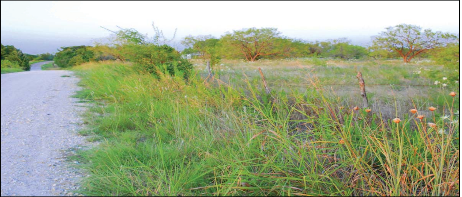
NW CR 1390, Looking East