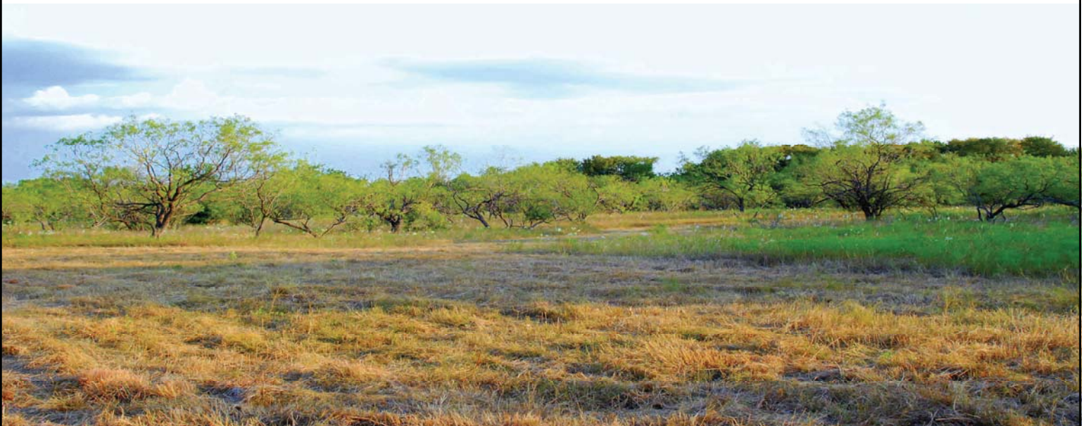
Front View from NW CR 1390

128 S. Fordyce Street Blooming Grove, TX 76626 Office: 903.695.2978 Fax: 903.695.2980